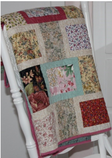
Scraps of Wisdom - March 2017