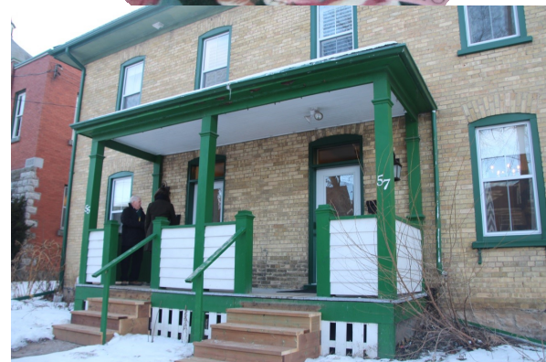
Waterloo County Quilters' Guild